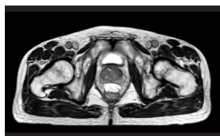
T2-weighted Magnetic Resonance image.*