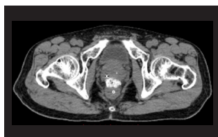
Computed Tomography image.*