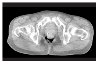
kV Cone-beam Computed Tomography image.*